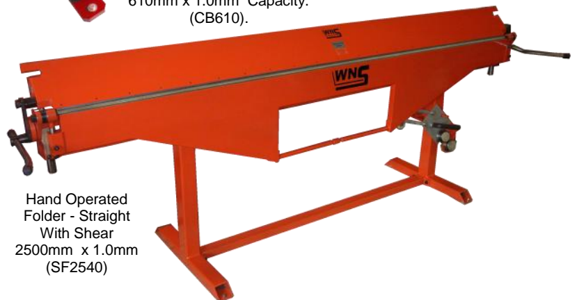
Hand Operated Folder - Straight With Shear 2500mm x 1.0mm (SF2540)

MANUAL FOLDERS - STRAIGHT are available in various models to accommodate different lengths and thicknesses of material. Some folders include angled stops for repetition bends and the SF2500 comes complete with a Rotary Shear. WNS 20swg (1.0mm) FLANGE FOLDER is the ideal machine when forming regular sized flanges. Designed to create a right angle flange on pre-cut sheet, this machine provides quick and easy folding of material up to 1.0mm thickness. There is no need to keep measuring, nor clamping. The Flange Folder also has the advantage of being 'open ended' allowing the user to also form inside flanges. Ideal for use with Pittsburgh Lock Rollformers.