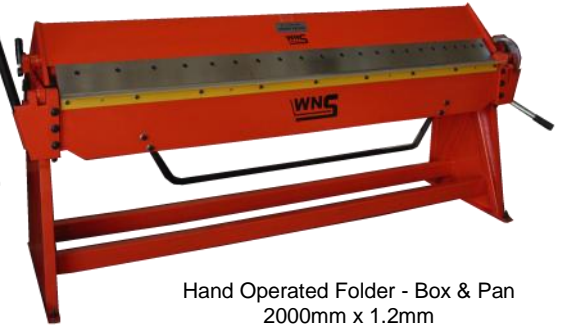
Hand Operated Folder - Box & Pan 2000mm x 1.2mm (BPF2000) & 1500mm x 1.2mm (BPF1500)