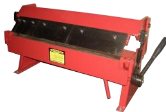
Hand Operated Folder - Box & Pan 600mm x 1.0mm (BPF600)