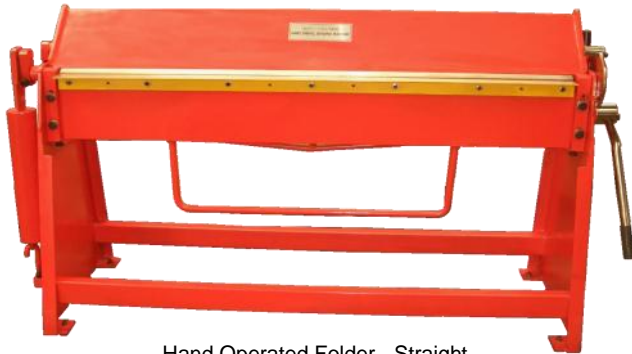
Hand Operated Folder - Straight 1500mm x 1.2mm (SF1500)

W. NEAL SERVICES LTD 29 Purdeys Way Purdeys Industrial Estate Rochford Essex SS4 1ND ENGLAND