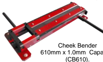
Cheek Bender 610mm x 1.0mm Capacity. (CB610).