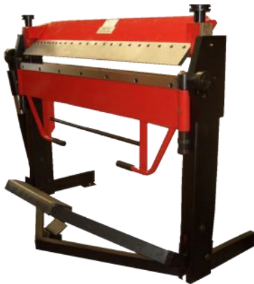
Foot Operated Folder - Box & Pan Foot Clamping 1270mm x 1.5mm (BPFC1270)