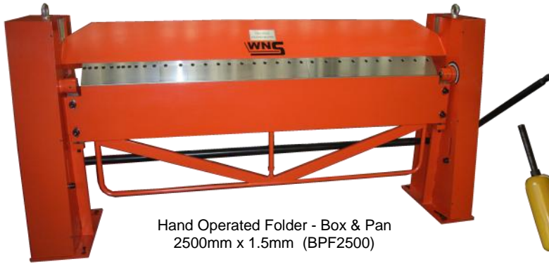
Hand Operated Folder - Box & Pan 2500mm x 1.5mm (BPF2500)

W. NEAL SERVICES LTD 29 Purdeys Way Purdeys Industrial Estate Rochford Essex SS4 1ND ENGLAND