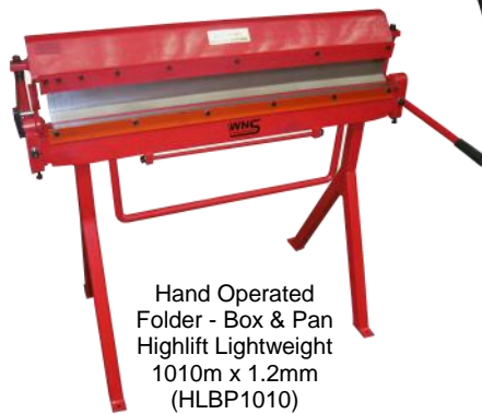
Hand Operated Folder - Box & Pan Highlift Lightweight 1010mm x 1.2mm (HLBP1010)