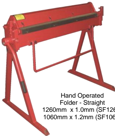
Hand Operated Folder - Straight 1260mm x 1.0mm (SF1260) 1060mm x 1.2mm (SF1060)