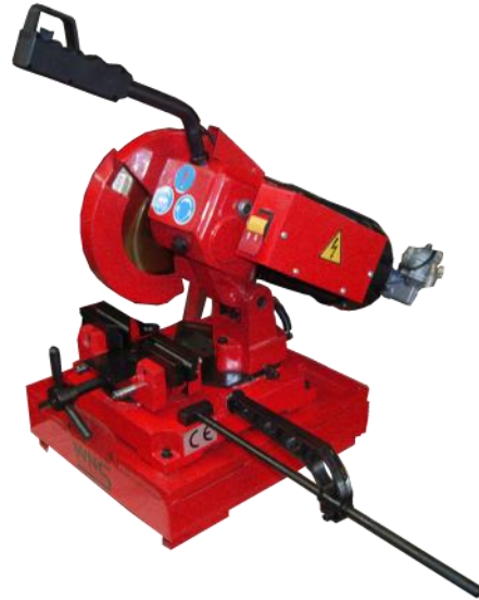
Circular Cut Off Saw 225mm Blade. Single Speed. (CS225)

The CIRCULAR CUT OFF SAWS are used for cutting tubing, pipe, angle iron, and more. The saw has a solid steel base with a coolant tank and pump included as standard. A material stop is included to achieve multiple repeatable cuts. The machines are fully guarded.